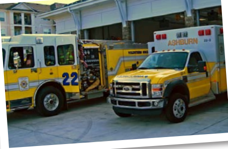
Station 22 in Lansdowne