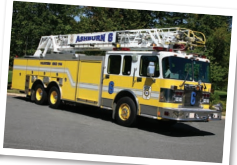
Station 6 in Ashburn